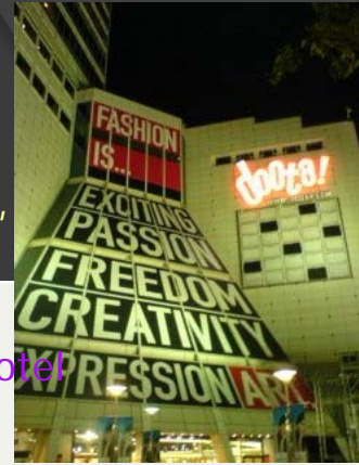
A massive shopping area