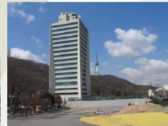
Tower hotel (3 stars)