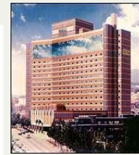
Sofitel Ambassador hotel (4 stars)