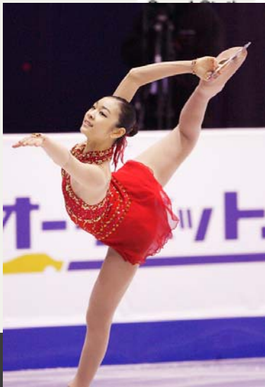
Shopping and entertainment