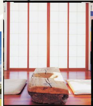
Janganpyong: Korean antique shopping area