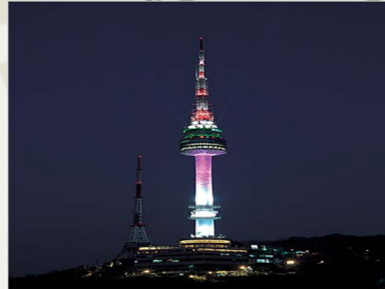
Landmark Namsan tower