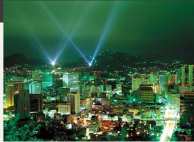
A massive shopping area