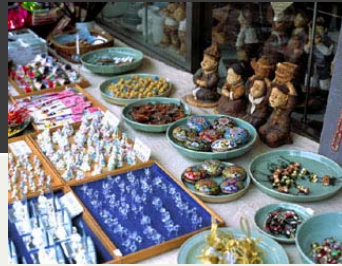
Insa-Dong: Galleries, traditional restaurants, traditional teahouses, and cafes